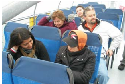
Cold and wet, GSE team members still enjoyed their boat trip.

The North Whidbey Sunrise Rotary Club was one of several local Clubs to have responsibility for hosting five up-and-comers, plus their business-seasoned Team Leader, last May. Besides being introduced individually to businesses similar to their own, members of the 2009 Group Study Exchange (GSE) were treated to a number of group activities, including a boat tour of the Deception Pass area on what turned out to be the coldest, wettest day in May.