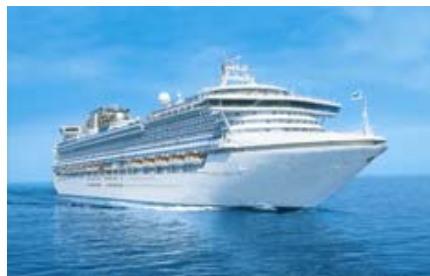
The Sapphire Princess departs Seattle June 12, returns June 19