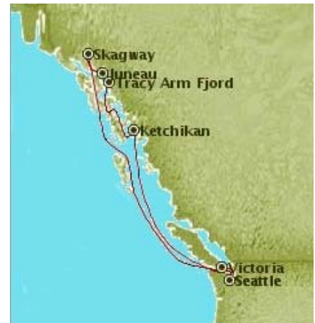
Round trip includes popular ports-of-call on Alaska's Inland Passage