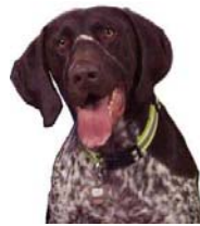
The Oak Harbor Holler December, 2009